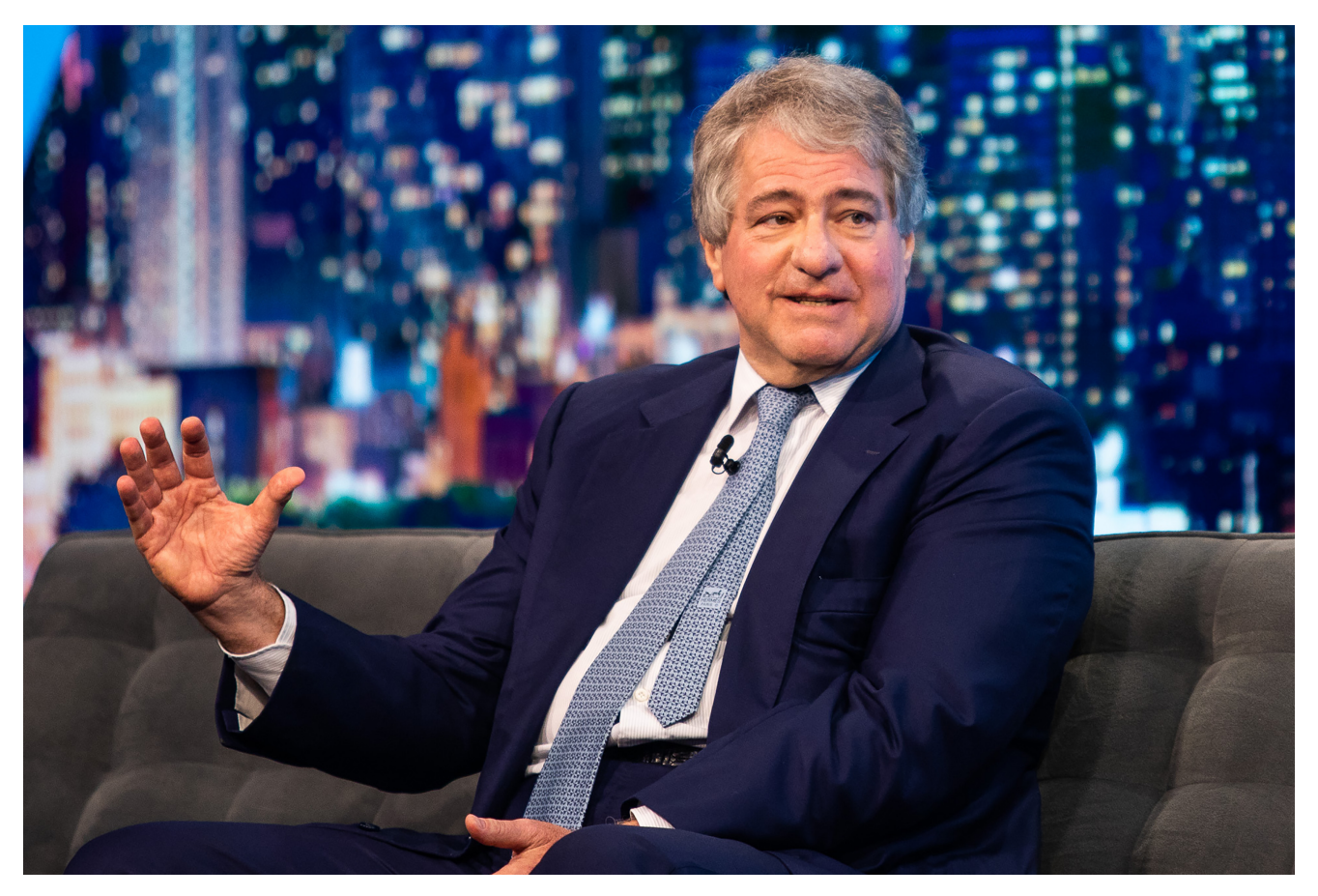
Leon Black was accused in a lawsuit Tuesday of raping a teenage girl inside Jeffrey Epstein's Manhattan townhouse.