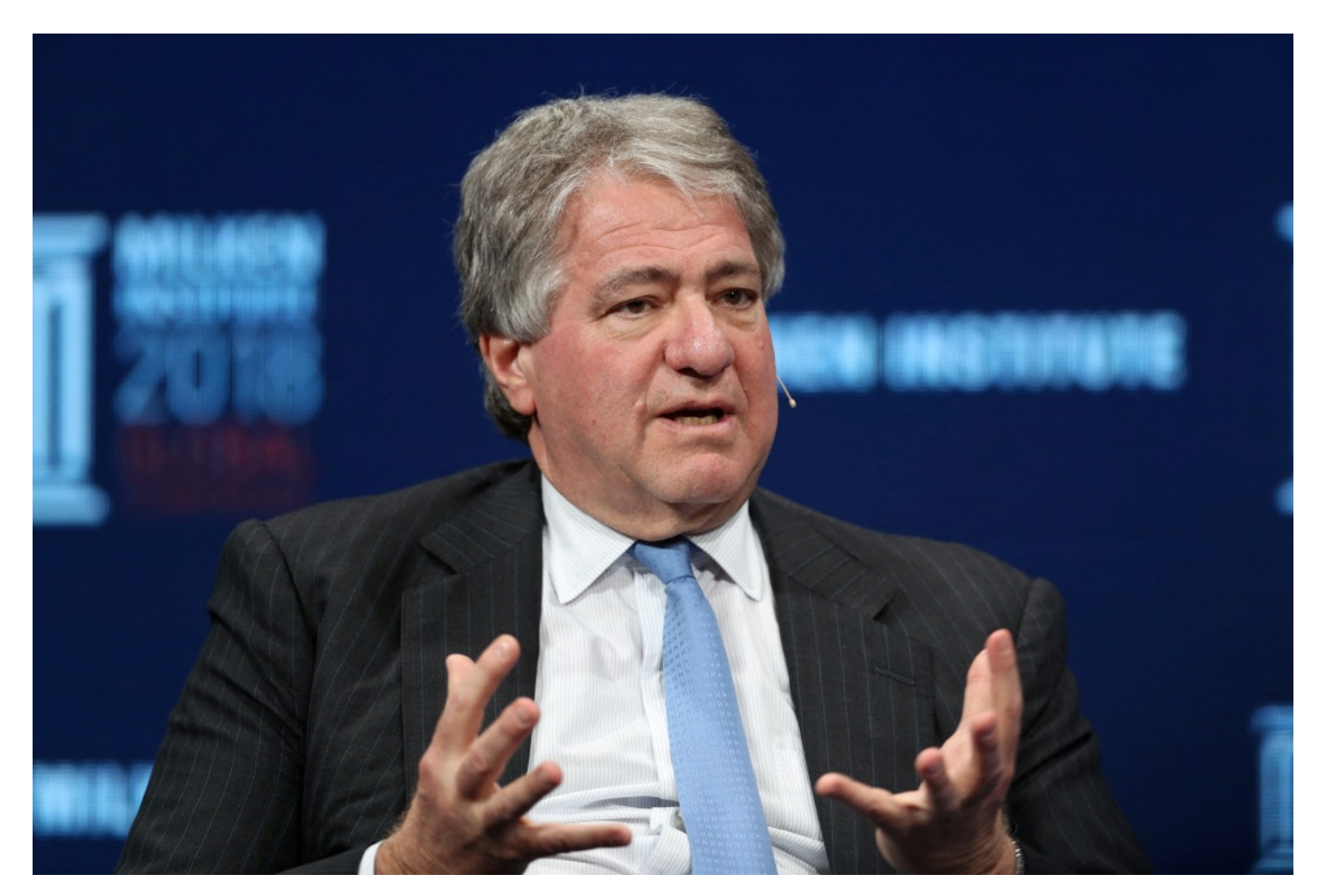
Black has been accused of sexual assault by other women in the past.

Black's lawyer, Susan Estrich, rejected Doe's claims, calling the lawsuit frivolous.