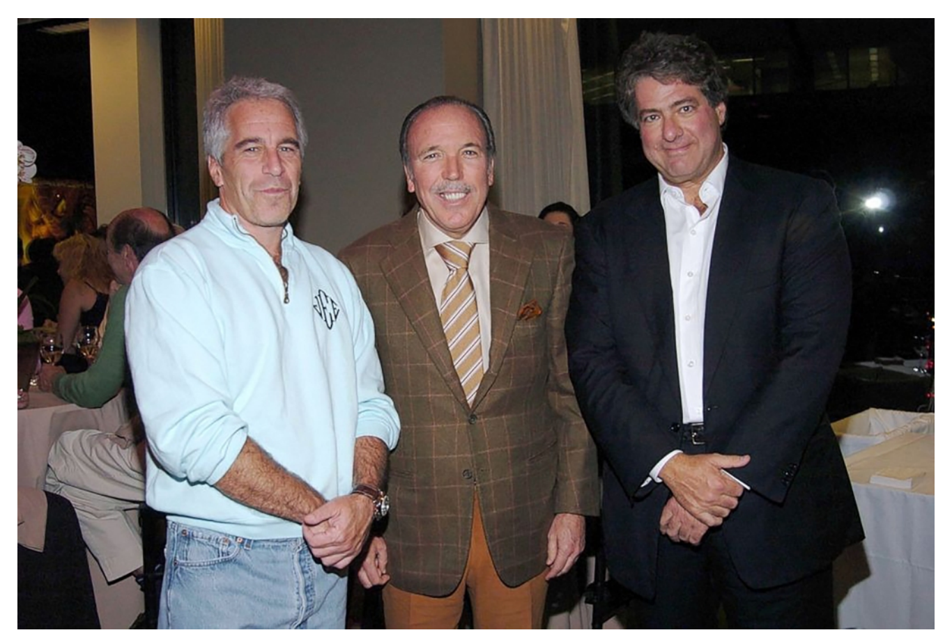
The complaint claims Epstein facilitated a "hand off" of the victim to Black, right.

She claims she was ordered to strip naked and give Black the same massages she gave Epstein.