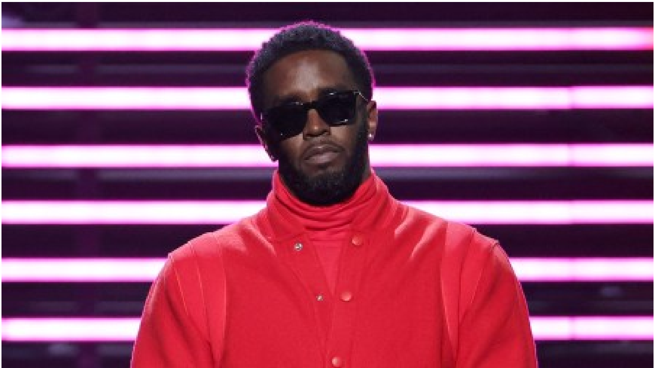
Sean Combs

Homes belonging to Sean “Diddy” Combs in Los Angeles, New York and Miami were raided by federal agents on Monday amid a sex trafficking investigation involving the rapper.