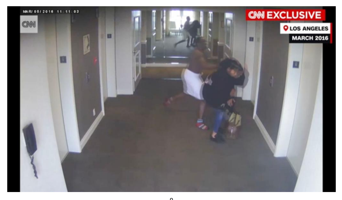
<u>8</u> Sean "Diddy" Combs attacking then-girlfriend Cassie Ventura. CNN

The video, <u>obtained by CNN</u> and dated March 5, 2016, shows the rapper and producer running after the singer down a hallway at the InterContinental Hotel in Century City, Los Angeles.