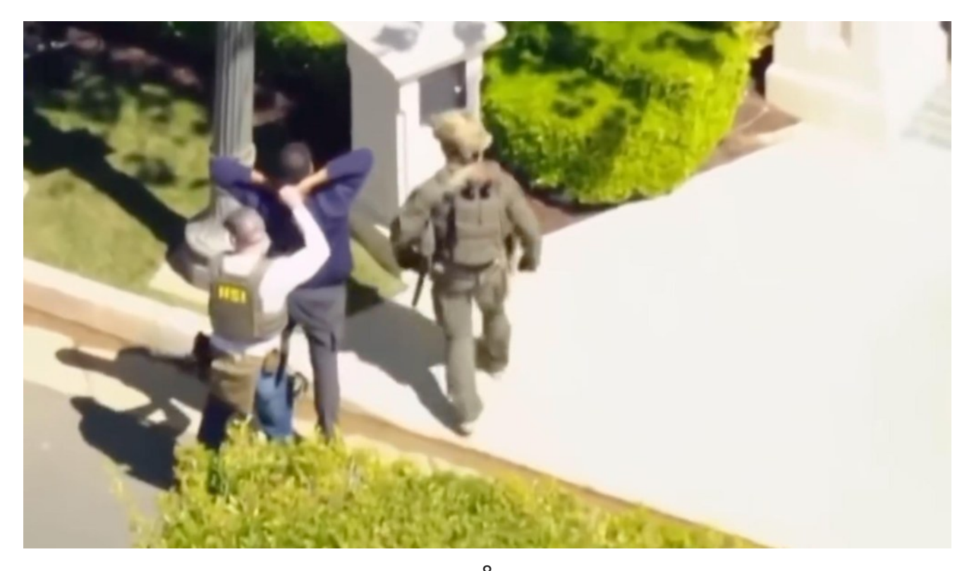
\frac{8}{5} Footage from the raid at Diddy's homes.